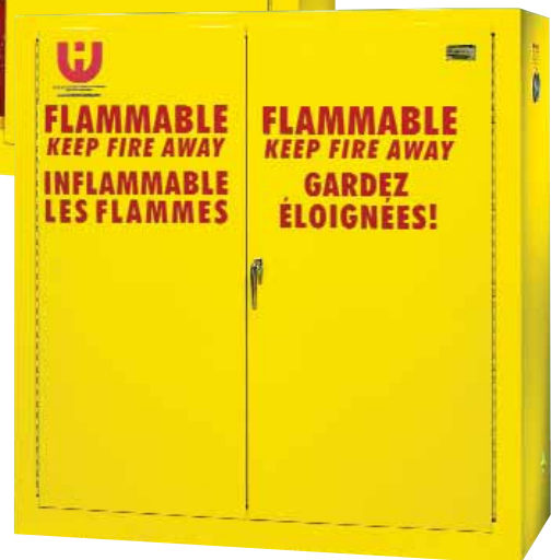
MODEL # WB30 EXTERIOR DIMENSIONS (HXWXD) (45 X 44 X 19)"